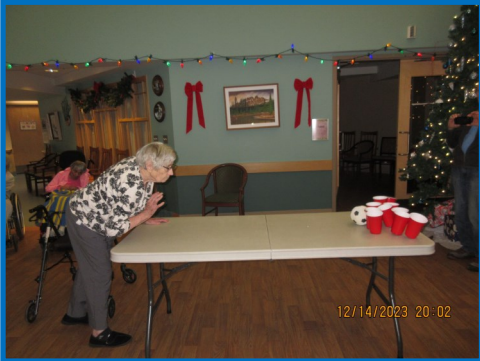
Table Bowling, Manicures, and a Winter Craft