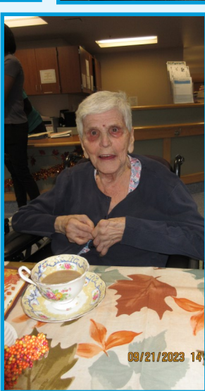
Meet and Treats with WRHA Executives