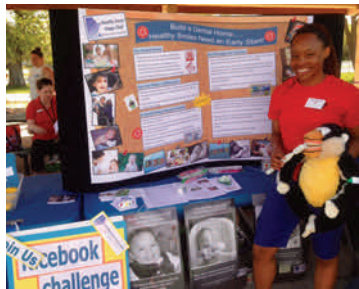
YMCA Healthy Kids Day