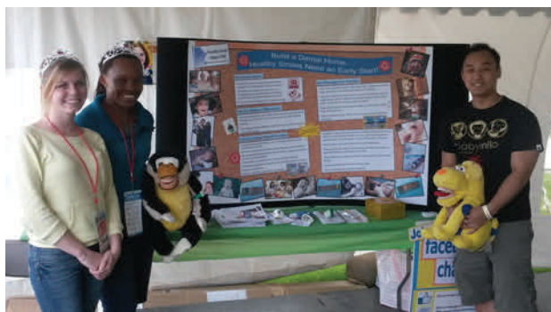
Tooth Fairy Saturday