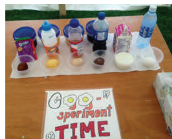
Teddy Bear's Picnic